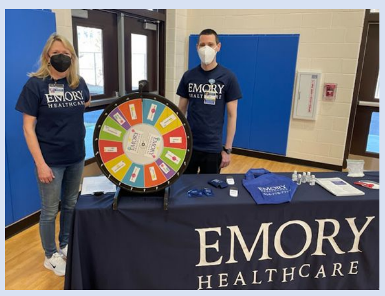
ADDTL' SERVICES STATION