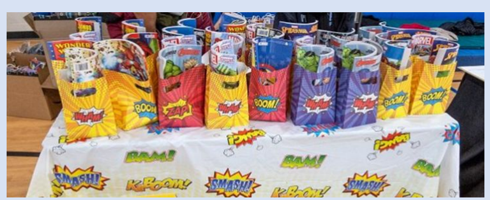
GIFT BAG STATION