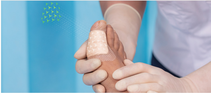
Mepilex® Border Flex