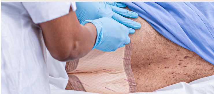
Mepilex® Border Sacrum