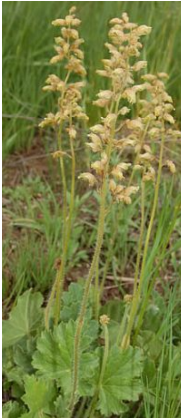
Prairie Alumroot ( Heuchera richardsonii )