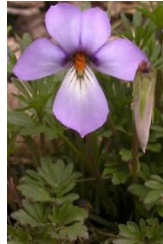
Birdfoot Violet ( viola pedata )

Prairie spring flowers are some of the first to bloom after winter's thaw and provide a welcoming delight to the warming months ahead. They provide an important source of pollen and nectar to a host of invertebrates including many bees and butterflies. The birdfoot violet is a host plant to many fritillary butterfly species, while prairie smoke is especially valuable to bumble bee queens that have overwintered and are in need of resources in the spring.