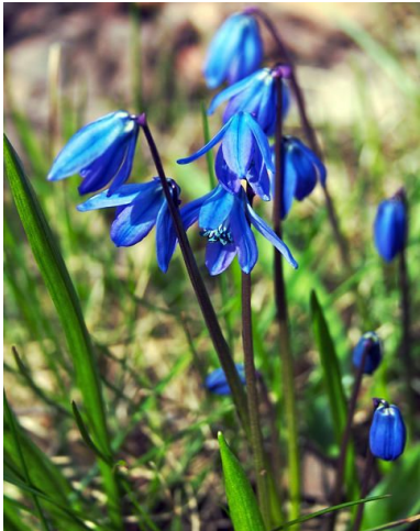
Siberian squill ( Scilla siberica )

Invasive species such as siberian squill, garlic mustard and goutweed threaten native woodland spring flowers! Do you part to identify and eradicate these species in natural areas where you can!