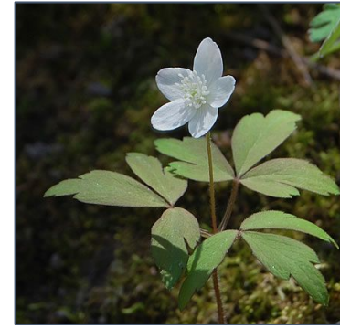
Wood Anemone ( Anemone quinquefolia )