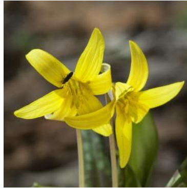
Yellow Trout Lily ( Erythronium americanum )