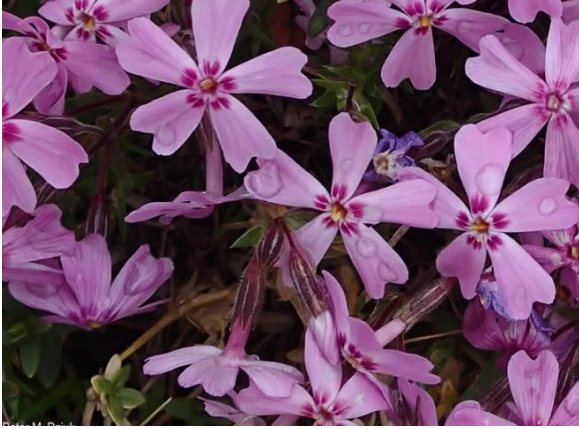
Moss pink, Creeping phlox ( Phlox subulata )

The April Moon will appear full for 3 nights from Monday morning to Thursday evening.