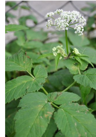
Goutweed ( Aegopodium podagraria )

-Large patches can occur quickly due to its prolific seed production.