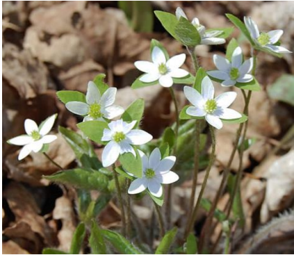
Sharp Lobed Hepatica ( Anemone acutiloba )