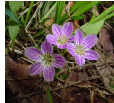
Spring Beauty ( Claytonia virginica )

Here are a few native spring flowering alternatives we can plant and look for in the landscape to celebrate in Minnesota!