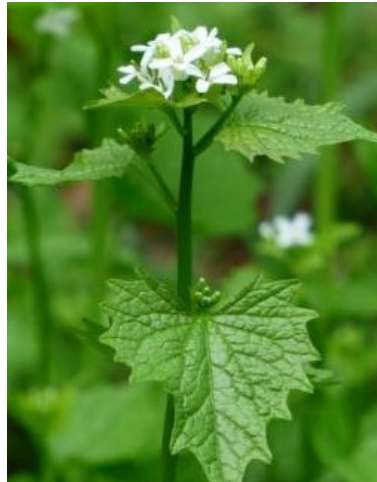
Garlic mustard ( Alliaria petiolata )

-Noticeably chokes out native spring ephemerals.