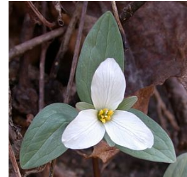
Snow Trillium ( Trillium nivale )

Spring ephemerals are a subcategory of wildflowers primarily found on the forest floor. They go through their entire life cycle before the forest leaves have fully emerged and close their canopy in early summer. That means they develop above ground parts in March and April, flower, and go to seed all before they die back to their underground parts by May or June. In doing so, spring ephemerals take advantage of sunlight that penetrates the bare branches of the deciduous woodlands. Sharp lobed hepatica capitalizes on this as well, though contrary to other ephemerals, their leaves persist through the summer and following winter.