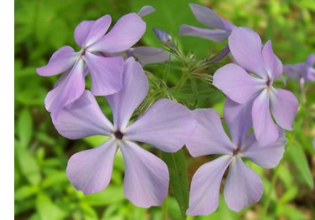
Wild Blue phlox ( Phlox divaricata )