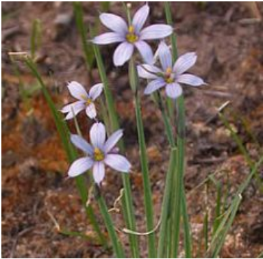
Blue-Eyed Grass ( Sisyrinchium campestre )