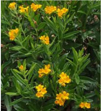
Hoary Puccoon ( Lithospermum canescens )