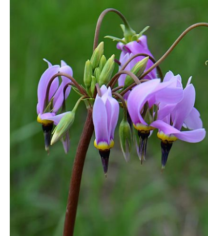
Prairie Shooting Star ( Dodecatheon meadia )