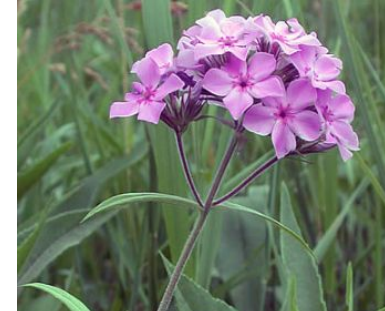
Prairie Phlox ( Phlox pilosa )

Creeping phlox is often used as ground cover, for rock gardens and border plantings. In Minnesota native landscapes however, it can be considered a non-native weed.