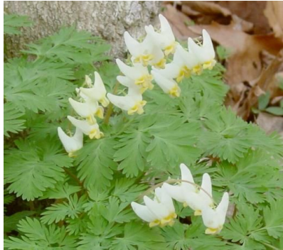
Dutchman's Breeches ( Dicentra cucullaria )