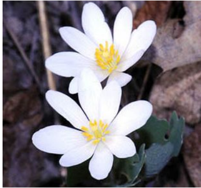
Bloodroot ( Sanguinaria canadensis )