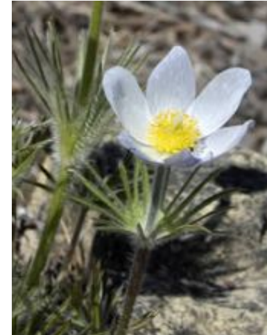
American Pasqueflower ( Anemone patens )