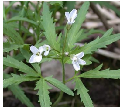
Cut-Leaved Toothwort ( Cardamine concatenata )