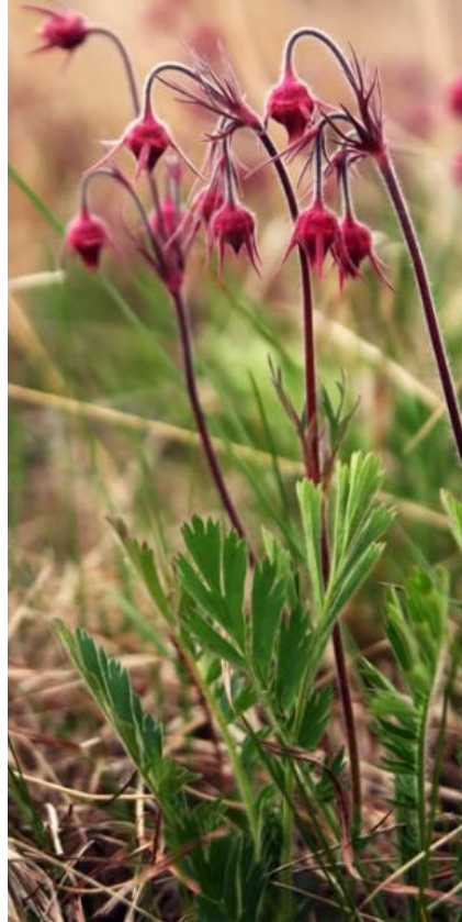
Prairie Smoke ( Geum triflorum )

Prairie spring flowers are some of the first to bloom after winter's thaw and provide a welcoming delight to the warming months ahead. They provide an important source of pollen and nectar to a host of invertebrates including many bees and butterflies. The birdfoot violet is a host plant to many fritillary butterfly species, while prairie smoke is especially valuable to bumble bee queens that have overwintered and are in need of resources in the spring.