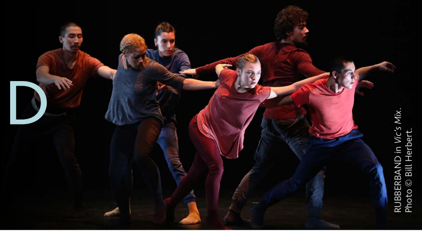
RUBBERBAND in Vic's Mix.