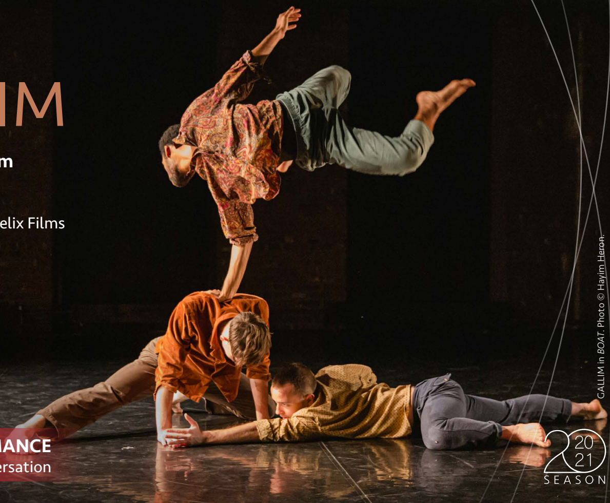
GALLIM in BOAT.