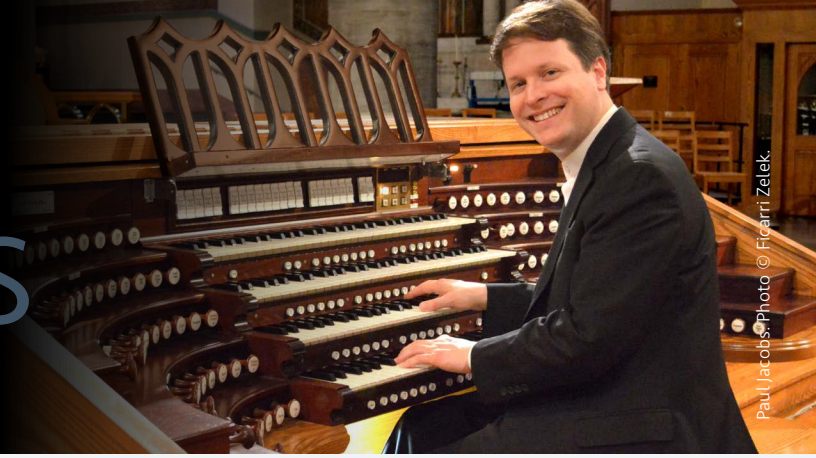
Paul Jacobs